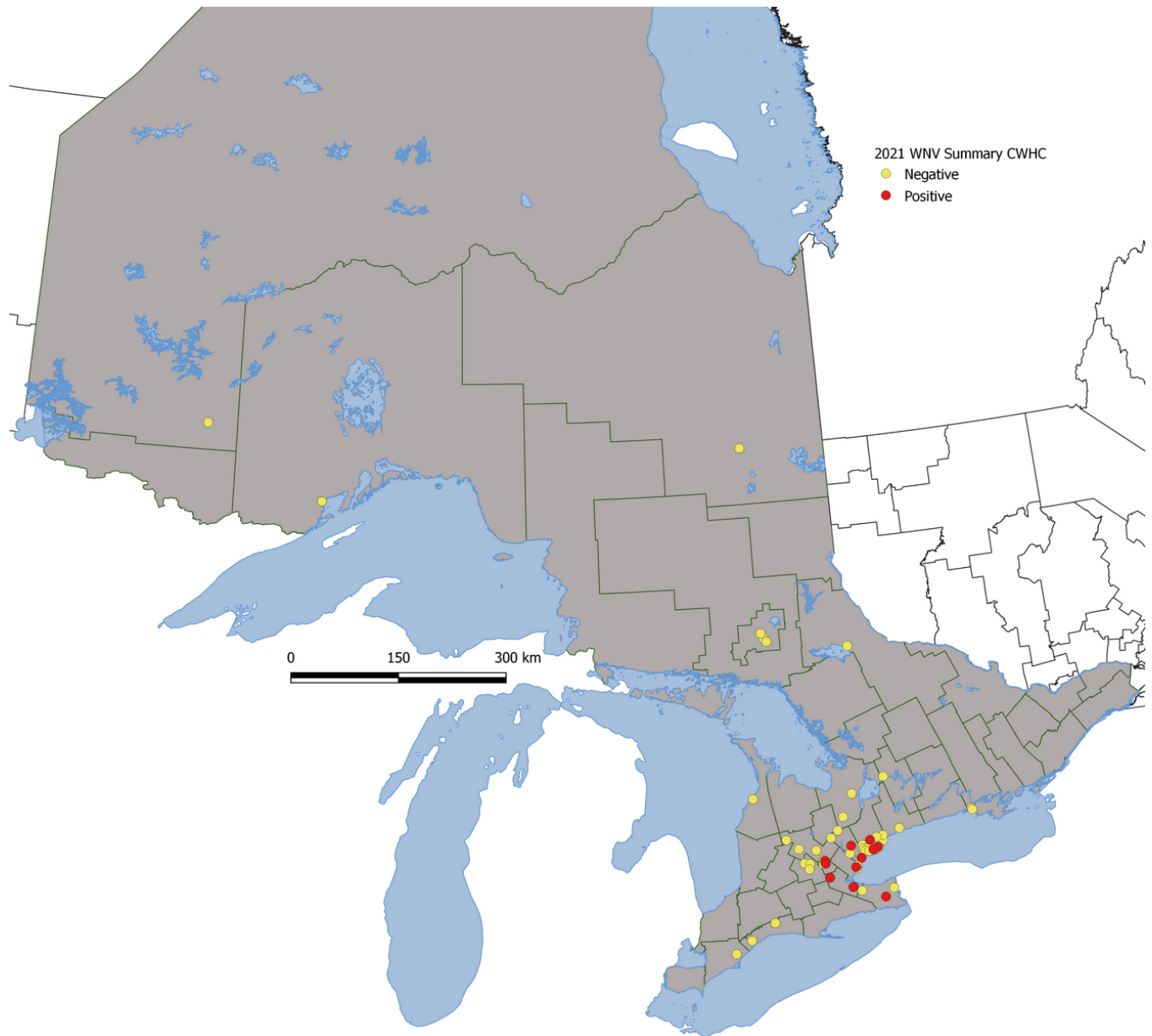
Figure 1. Location of birds tested for West Nile Virus in Ontario in 2021. Red locations tested positive, yellow tested negative.

The CWHC Ontario/Nunavut Region has tested 70 birds for the presence of West Nile Virus (WNV) in 2021. All corvids and raptors submitted to the CWHC during the season were tested along with any other birds with known susceptibility, exhibiting neurological signs, or showing lesions consistent with WNV. Of the 70 tested, 12 confirmed positive for the virus by real-time RT-PCR.